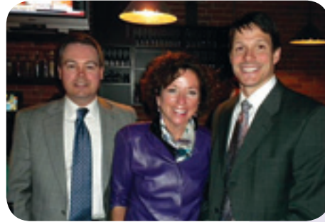
Olive and Twist Cocktail Party