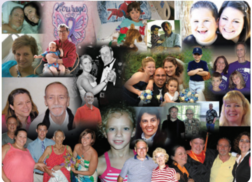
30 Days of Courage Project November 2010

Each chapter shares the central mission of the NPF but has the flexibility to address community needs in ways that are meaningful for that particular area. Chapters will be engaged in patient outreach, physician outreach and fund raising. We are excited to watch as these wonderful volunteers find ways to impact the lives of those living with diseases of the pancreas.