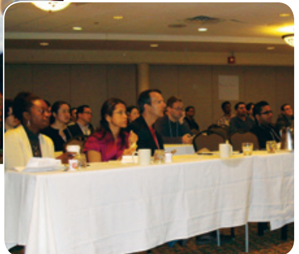
Fellows Symposium, April 2010